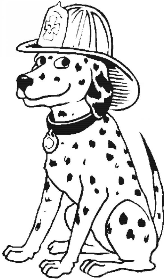
The dog had a hat.