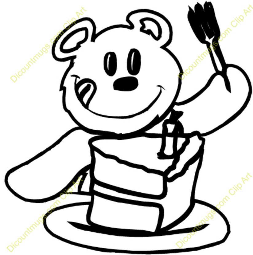
The bear had some cake.