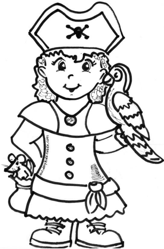
The pirate had a parrot.